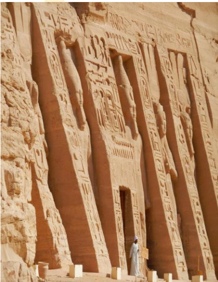
Nefertari Abu Aimbel